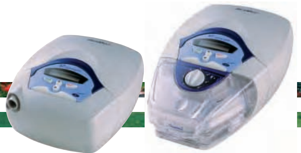
S7 Lightweight with and without optional integrated humidification

Simplified menus make the S7 Lightweight particularly user-friendly for patients and sleep professionals. Backlit buttons on the S7 Lightweight and a large operating dial on the HumidAire 2i make the entire system easy to use—even in the dark.