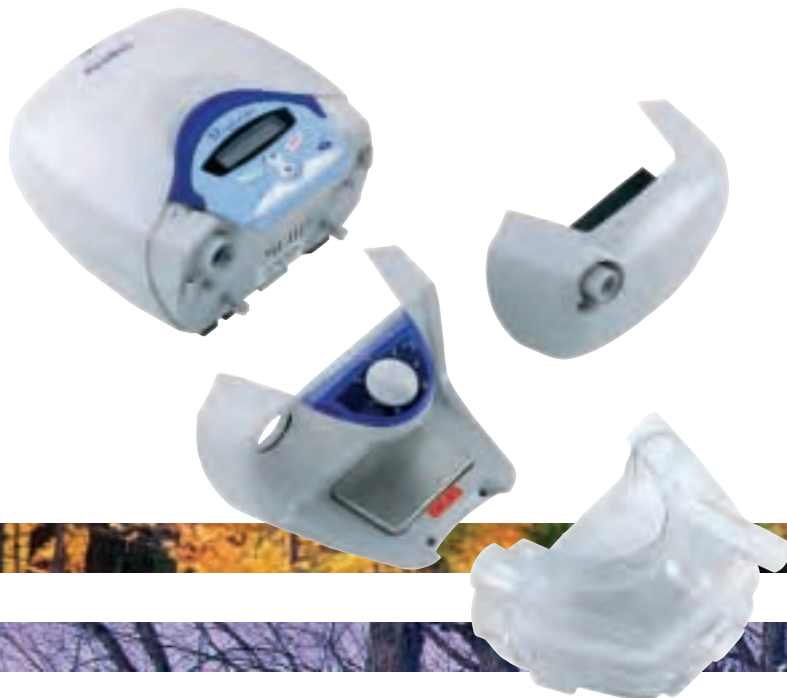
ResMed's latest modular design sits attractively on the patient's bedside table